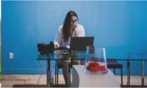
Business & Administration Jobs