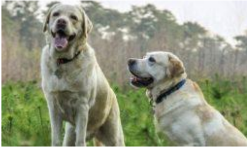
Environment, Land & Animal Jobs