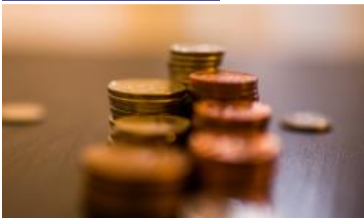
Legal, Finance & Accounting Jobs