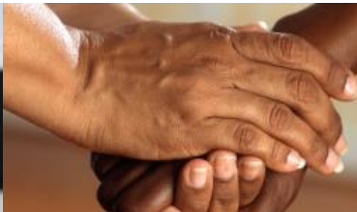
Social Care Jobs