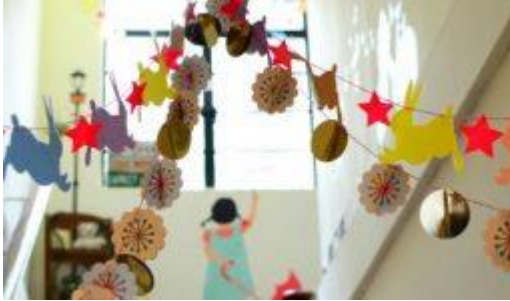
Childcare & Education Jobs