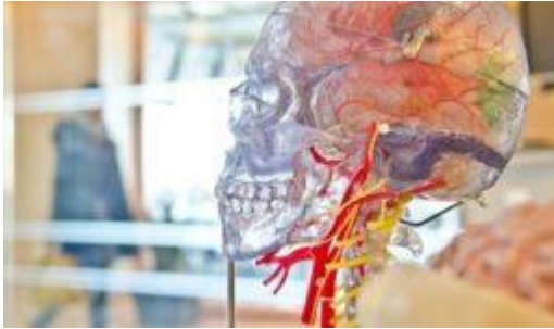
Health & Science Jobs