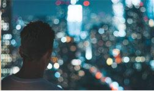
Energy, Water & Sustainability Jobs