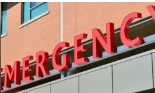
Protective Services Jobs