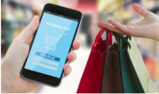
Retail Jobs & Careers