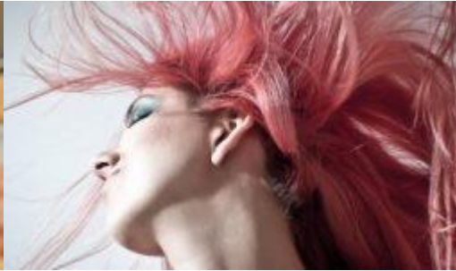
Hair & Beauty Jobs