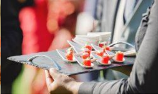
Catering & Hospitality Jobs