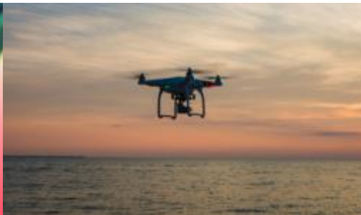
Engineering & Manufacturing Jobs