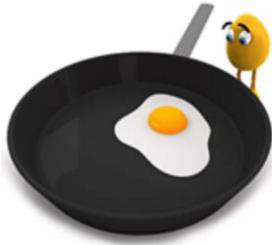
Frying an egg